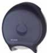
Jumbo Roll Dispensers ITEM # 10.02