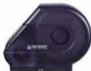
Jumbo Roll Dispensers ITEM # 11.02S