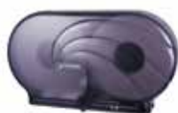
Jumbo Roll Dispensers ITEM # 12.02