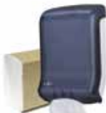
Towel Dispensers ITEM # 51.02 | Ultrafold™ Large Capacity Multi-fold Towel Dispenser