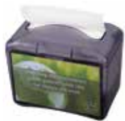
Napkin Dispensers ITEM # 14.02