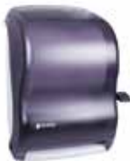
Towel Dispensers ITEM # 20.02 | Lever Roll Towel - HWT Dispenser