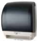
Towel Dispensers ITEM # 80.02R | Electronic Hands-Free Roll Towel Dispenser