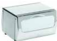
Napkin Dispensers ITEM # 14.03

Mini-Fold Napkin Dispenser / Tabletop Dispenser