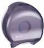
Jumbo Roll Dispensers ITEM # 11.02